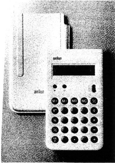
Fig. 2) Input functions of this Braun pocket calculator are coded in green, output functions are in red. The clear legible display and the arched keys facilitate fast computations. If the power switch is left on, it automatically turns itself off after six minutes. Design: Dietrich Lubs.

ject become more placid, soothing, perceptible, and long-living. Much design today is modish sensation and the rapid change of fashion outdates products quickly. The choices are sensible: disciplined simplicity or forced, oppressive, stupefying expression. For me there is only one way: discipline.